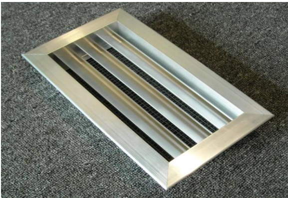
Miter Cut Louvers - Rain Lip on Riveted Blades