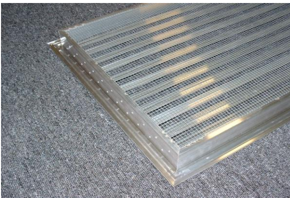
Louver is 2.0" in depth with a 1-1/4" front mounting flange